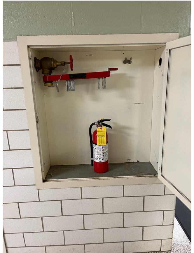
Fire Hose Cabinet Interior